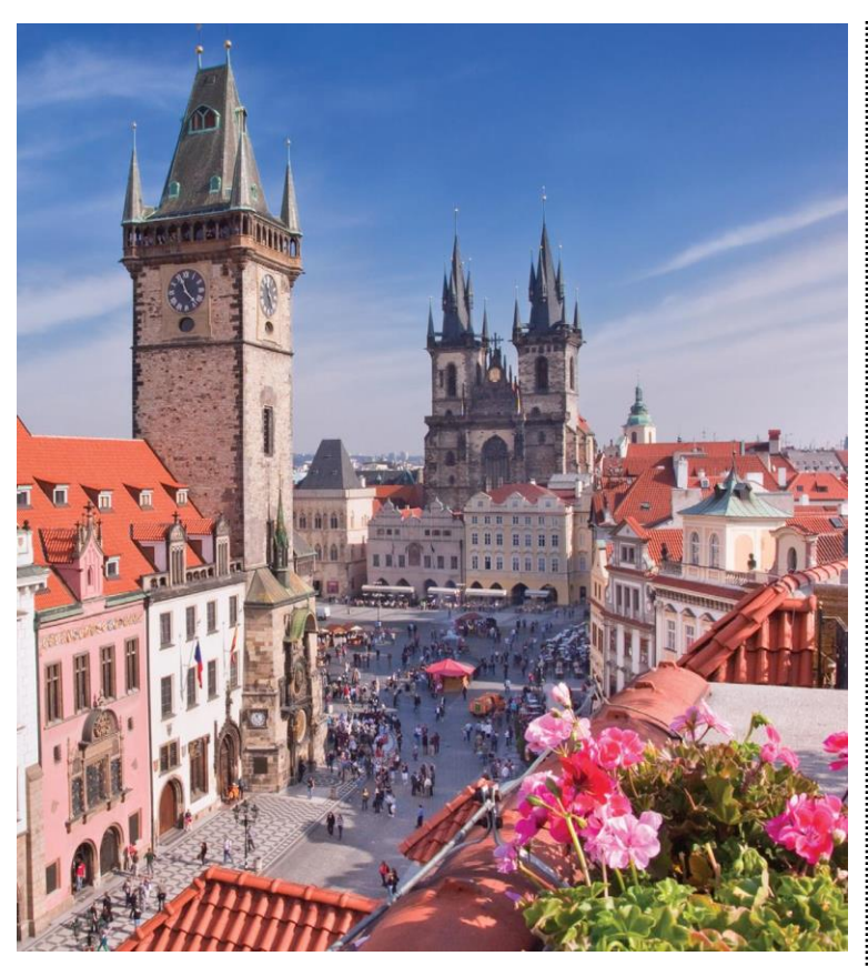
13 Days • 18 Meals: